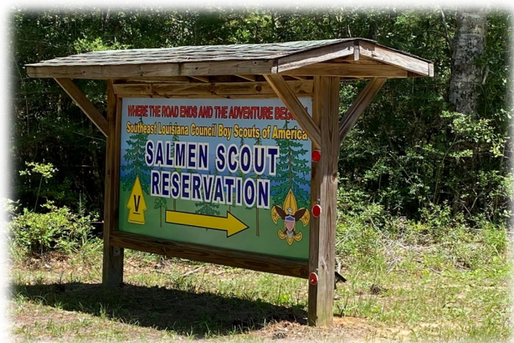
SALMEN SCOUT RESERVATION

27585 V-Bar Road, Perkinston, MS 39573 Camp Phone: (288) 255-7336