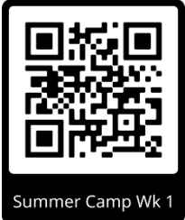
Summer Camp Wk 1