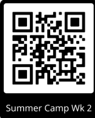
Summer Camp Wk 2

Online Registration bsa-selacouncil.org/SummerCampWk1 bsa-selacouncil.org/SummerCampWk2