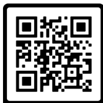
Summer Camp Wk 2