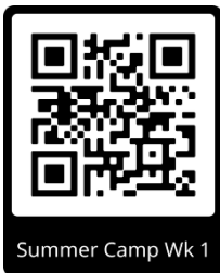
Summer Camp Wk 1