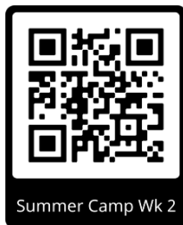
Summer Camp Wk 2

Online Registration bsa-selacouncil.org/SummerCampWk1 bsa-selacouncil.org/SummerCampWk2