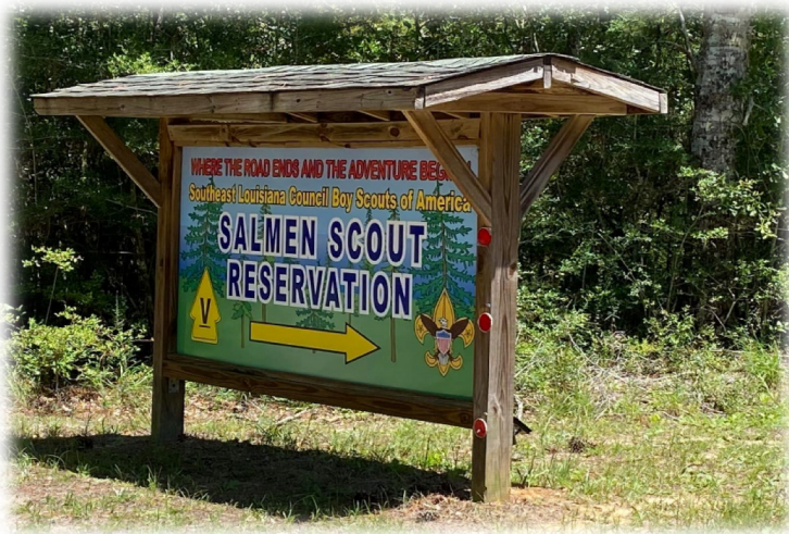
SALMEN SCOUT RESERVATION

27585 V-Bar Road, Perkinson, MS 39573 Camp Phone: (288) 255-7336